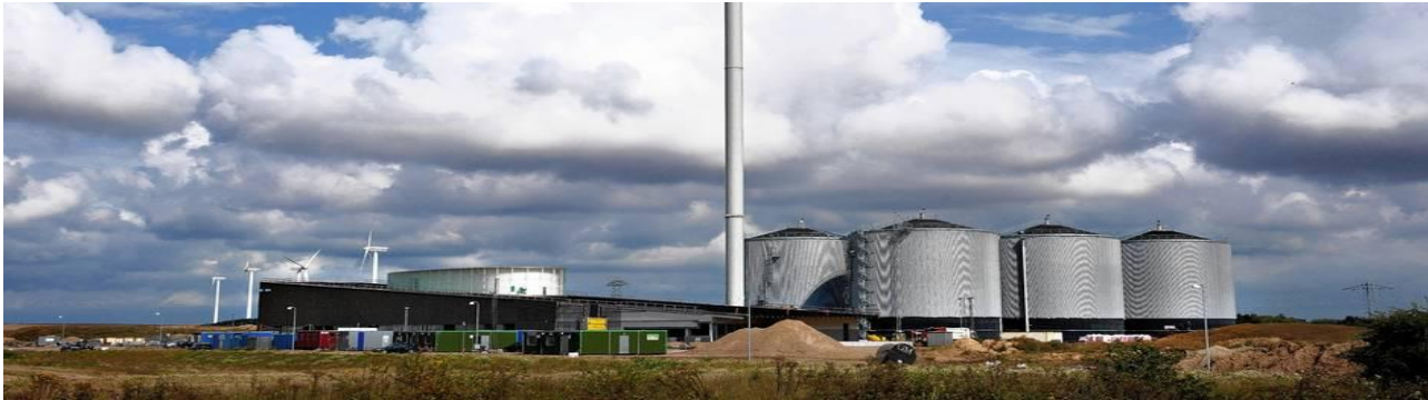
Figure 1. The Maabjerg biogas plant already in operation

stations are currently available. There is some discussion on projects to convert buses to using biogas, but in the short to medium term biogas is only expected to have limited use as a transport fuel.