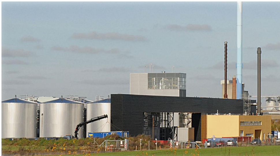
Daka Ecomotion biodiesel plant.

Emmelev A/S - Emmelev Mølle is the only Danish producer of 1st generation biodiesel based on rape seed oil. The annual production is around 100,000 tons of biodiesel, but there are plans for expanding the capacity. The major part of the production is shipped to Germany. Besides biodiesel, glycerine and feed cake are also produced at this plant.